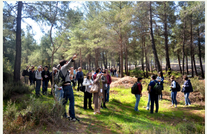
Discussion on a pine processionary spot during the field visit

Population genetics can be a powerful tool, as was clearly demonstrated through several presentations on the pine processionary moth (PPM) complex species and its parasitoids, as well as on Platypus cylindrus and the Turkish oak gall wasps. The power of this tool can be significantly increased at the landscape level. Several presentations looked at insect biodiversity in various ecosystems, especially oak and cedar forests. The possibility of using this faunal diversity as an indicator of ecosystem richness was discussed.