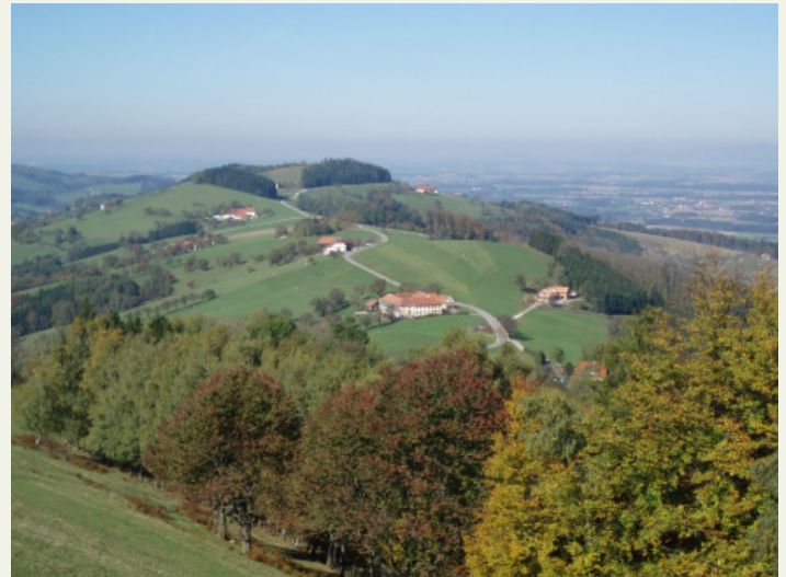
Rural landscape in Austria

The relationship between biological and cultural diversity or biocultural diversity and the rural territory is considered as one of the most important perspectives for the implementation of the Joint Program of Work. The scientific and policy dimensions of JP-BiCuD are of utmost importance in the European context where cultural, environmental and rural policies are devoted to the conservation of biodiversity and cultural heritage, but rarely focused on the features and the effects of the interactions between nature and culture. Yet, throughout European history, the outcomes of such interactions, including through traditional farming and forestry practices, have been critical for creating resilient landscape patterns, diversifying biological and cultural resources and shaping the cultural identity of different European subregions.